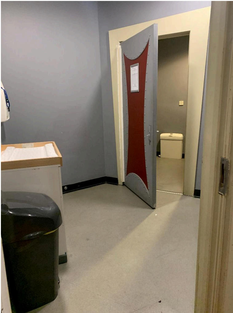
Baby changing area