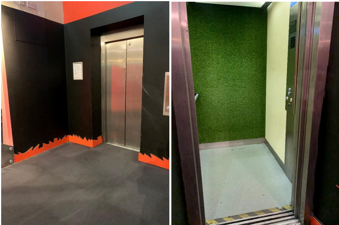
Lift exterior & interior

Alternative queuing arrangements are not always available; however, staff will assist where reasonably possible.