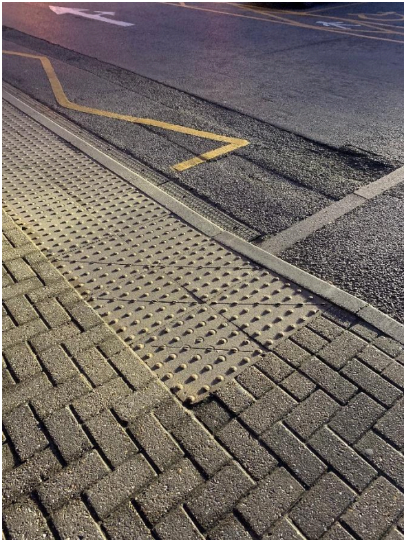
Dropped kerb at entrance