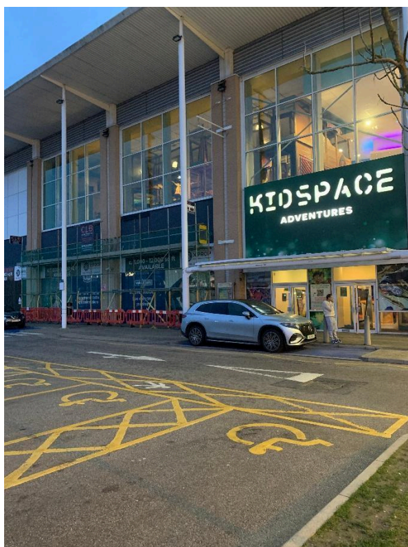
Entrance & drop-off zone

Visitors displaying the relevant Access Card symbol may request alternative queuing arrangements or rest seating during entry. Seating is available throughout the attraction, and staff can advise on the shortest walking routes if required.