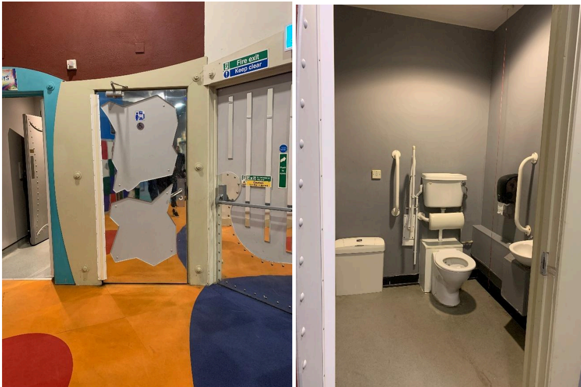
Accessible toilet exterior & interior