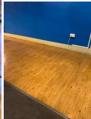
Main reception area