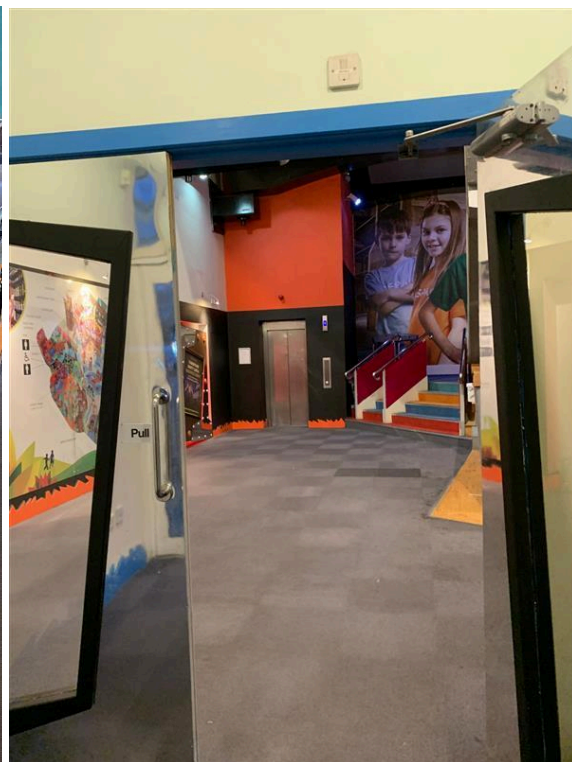
Access to lift area