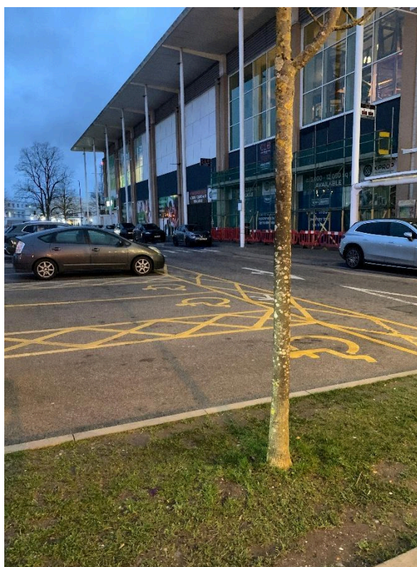
Accessible parking bays